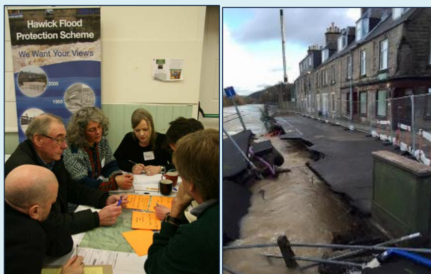
Community meetings to examine climate disadvantage and flood damage in Hawick, a town built on the river to power mills for the textile industry.

In Scotland, supporting vulnerable people, reducing inequities and taking action to mitigate and adapt to climate change are key national policy goals. Sharing the local level insights about the systematic links between climate change and issues that help shape more generalised community resilience stimulated ideas from national level stakeholders on how to create more joined up policy environments to better support action to build resilience in the context of climate change across different communities (essential 4). Thus, applying a climate disadvantage lens provided the basis for integrating other essentials into the process of enhancing resilience, including: ensuring a focus on shocks and stress (essential 2), encouraging horizontal working across inter-related aspects of climate change (essential 3), revealing important vertical links across social scales (essential 4), and providing opportunities for widening understanding of climate change more broadly (essential 6).