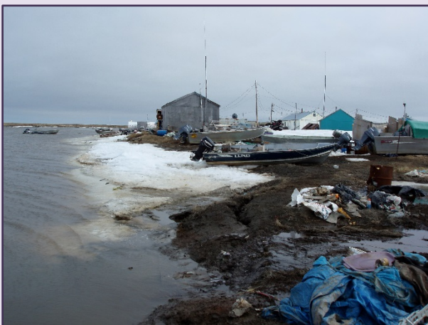
Climate-induced coastal erosion threatens Newtok.