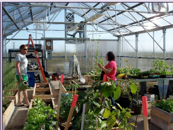
Igiugig greenhouse to enhance resilience of food security