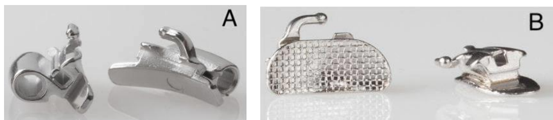
Figure 1: Types of molar tubes based on the mode of attachment. (A) weldable molar tubes (B) bondable molar tubes (3) .

A molar tube is a terminal attachment in the shape of a metal tube bonded on the buccal surface of molars through which the archwire slides as the teeth move (1) . They can be categorized based on the mode of attachment as weldable (welded onto bands) and bondable (bonded to the tooth surface) (Figure 1), based on the lumen shape as round, oval, and rectangular (Figure 2), based on the number of tubes as single, double, and triple (Figure 3), and based on the technique/prescription as Begg tube, Edgewise tube (0° tip and torque values), and pre-adjusted edgewise (with prescribed in-out, tip, and torque values) (2) :