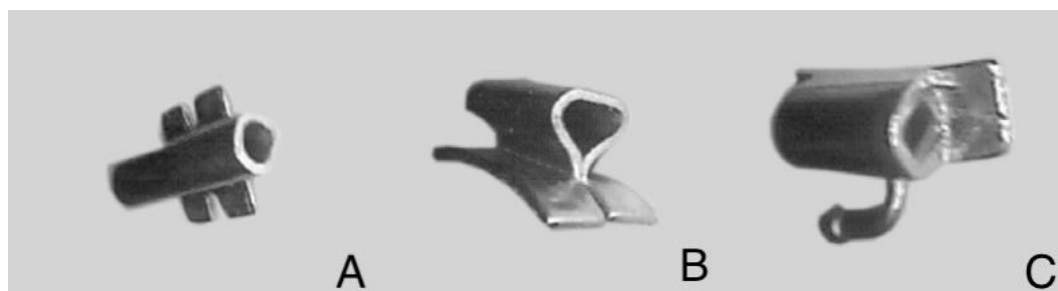
Figure 2: Types of molar tubes based on lumen shape. (A) round (B) oval (C) rectangular (2) .