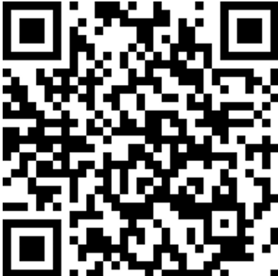
FIGURE 1: QR code for the video on cataract surgery

All patients were provided with a cataract letter pack, which informed the patients that they could now benefit from cataract surgery while highlighting that the surgery is voluntary, and the information enclosed aimed to help them make the correct decision regarding risk and benefit. The pack contained: 1) a cataract surgery consent form; 2) a cataract surgery information leaflet in paper form as the current standard of care (SoC); 3) a printed QR code linked to a supplementary patient information video on cataract surgery (Figure 1); and 4) a questionnaire that did not include the name or identifiable information.