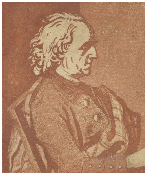
Profile of a Man. Highland Laird - a detail, David Allan Creative Commons - CC by NC