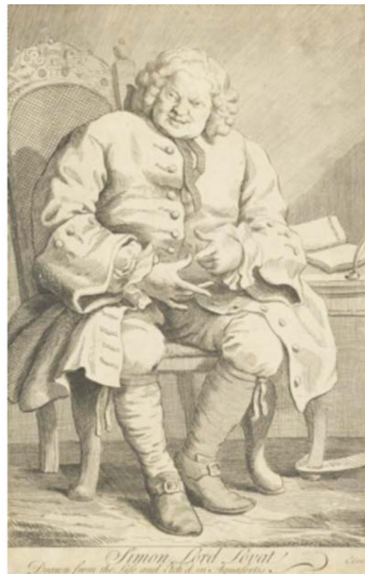
Simon Fraser, Lord Lovat, c 1667 - 1747, Jacobite, multiple artists Creative Commons - CC BY NC