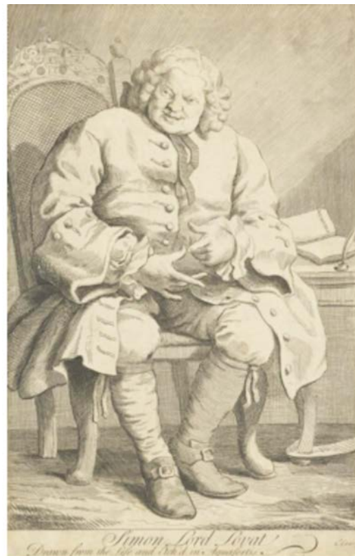
Simon Fraser, Lord Lovat, c 1667 - 1747 Jacobite... multiple artists Creative Commons - CC BY NC