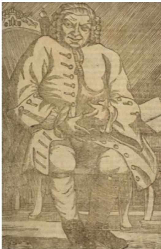
Simon Fraser, Lord Lovat, c 1667 - 1747 Jacobite...

Figure 6: Fig. 6: David Allan, A Highland Laird , aquatint, (undated). A detail. Courtesy of the Scottish National Galleries.