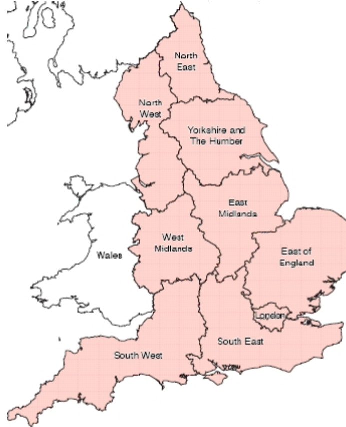
Figure 1: Government Office Regions (GORs) in England and Wales