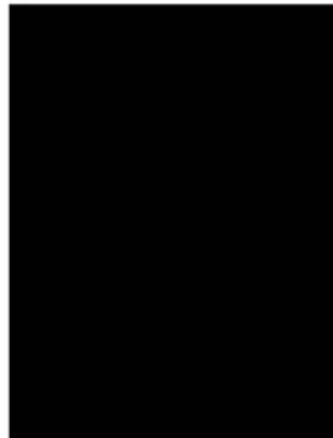
Figure 3 - Richard Long, 'On this Hillside', 1972