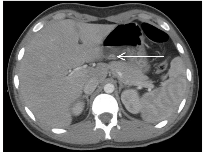
Figure 3. Abdominal CT showing 1.2-cm mucosal-based lesion lying posteriorly in the gastric antrum.

and was started on salvage chemotherapy with cisplatin, ifosfamide, and paclitaxel (TIP regimen). Having completed salvage chemotherapy at the time this report, the serum hCG level was within normal limits, and a CT-PET showed no fluorodeoxyglucose (FDG) avidity, consistent with response to treatment.