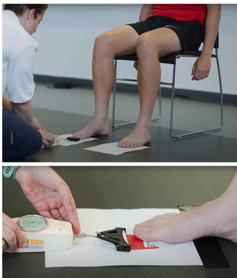
Fig. 1. A demonstration of the EPGT ( https://www.youtube.com/watch?v=hSNVGVDftyY&t=265s ).

perfectly valid for biomechanical studies [19], but within the context of screening it also implies that average strength is most critical for the risk of falling. This assumption is not necessarily supported by literature [20]. For example, one could also argue that the strength of the weakest limb or the asymmetry in strength between limbs are also important [20]. To provide insight on the optimal outcome measure to be used in future screening applications, in addition to average EPGT force (AvgEPGT), the value of the EPGT force of the weakest limb (MinEPGT), of the strongest limb (MaxEPGT) and their normalised difference (DiffEPGT) were also calculated. Normalised difference between limbs was calculated as follows: