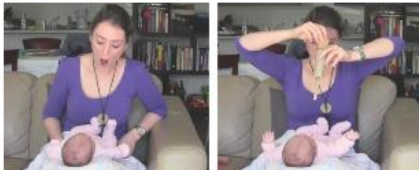
Figure 2 In the Oostenbroek et al. procedure, infants were balanced on the experimenter's lap leading to poor postural control (Photos from: Kennedy-Costantini, Slaughter, Nielsen, 2016.)

Adequate postural control is fundamental to studies with neonates. Oostenbroek et al. used unsatisfactory postural support. The neonates were balanced on the lap for all 11 demonstrations. The stimuli involving object-movement required that the experimenter use both hands to manipulate the stimulus (see Figure 2), thus infants could roll from side to side (similarly, neonates were balanced on the lap and one hand was used to show the manual gestures). The threat of postural imbalance is disruptive to young infants (von Hofsten, 1982, 2004): “Several reflexes have been identified that serve that purpose....They typically interrupt action” (von Hofsten, 2007, p. 56). In Meltzoff and Moore's experiments, a procedure was instituted to eliminate postural imbalance. As stated in the published work, neonates were well supported in a padded infant seat, which assured a stable posture (e.g., Meltzoff & Moore, 1983a, 1994). Also, Nagy et al.'s (2013) and Soussignan et al.'s (2011) papers affirmed the importance of postural control in neonatal imitation. Oostenbroek et al. ignored this aspect of neonatal testing, which would bias the study towards null results.