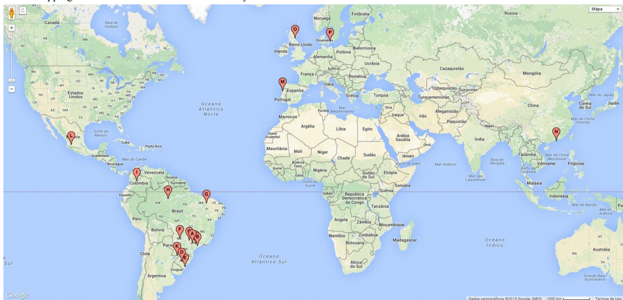
Figure 1. Mapping of the institutions involved in the study.