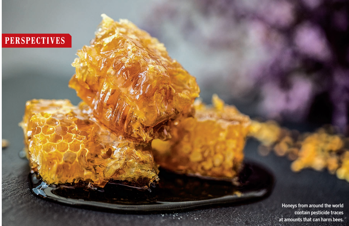
Honeys from around the world contain pesticide traces at amounts that can harm bees.