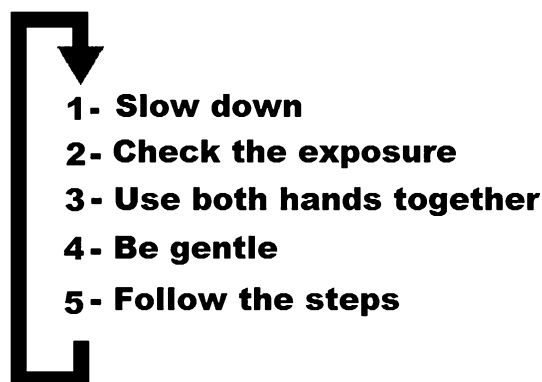
Fig. 1 Performance-based checklist

Each gall bladder was graded (1–3) anatomically as an indication for the potential procedural difficulty [11]. The hierarchal task analysis involved the division of laparoscopic cholecystectomy into three component task zones. Task (1) is the dissection of cystic duct and artery in Calot's triangle, starting by grabbing the fundus of the gallbladder and ending by insertion of the clip applicator. Task (2) is starting by the insertion of the clip applicator and ending by the transection of both the cystic artery and cystic duct. Task (3) is the separation of the gallbladder from the liver bed, starting after the transection of both the cystic artery and cystic duct and ending by complete separation of the gallbladder from the liver bed.