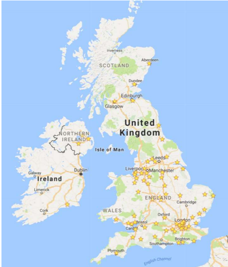
Figure 1. Map of the United Kingdom and Ireland showing locations of all participating breast units