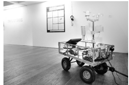
Fig. 3. The Biotagging rover in the Future-sonic 2009 exhibition (Photo © WeAreTAPE)

Through Biotagging , we asked participants to record and describe in their own words ('tag') the plants and animals they encountered within a local, urban area, along with any other contextual information that they felt meaningful and relevant. We hoped to create a more inclusive, community-driven and valued approach to generating knowledge on biodiversity. We chose the idea of 'tagging' as we were particularly interested in processes of categorisation (e.g. Folksonomy) which are emergent rather than prescribed. What is powerful about this approach is that it involves people in the politics of information management and encourages thinking about larger patterns and systemic understandings of the world [1]. Crucially, naming and categorisation by themselves are not enough; plants and animals need to be embedded in narratives of personal experience, emotions and history to give them meaning.