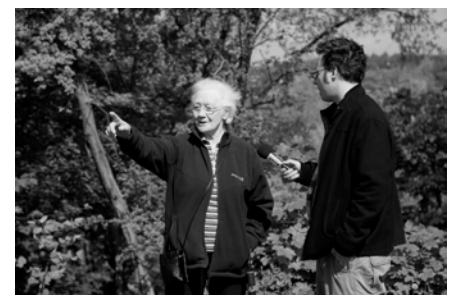
Fig. 5. Documenting local knowledge in Biotagging

We feel that for future developments of Biotagging or similar projects, it will be pertinent to explore how the 'data' – in this case captured by film – can co-exist with, contribute to, or be enriched by more conventional and 'mobile' products of biodiversity monitoring such as species surveys and distribution mapping. It is expected that in combination, such alternative methods for knowing and documenting biodiversity could serve to, a) enhance and clarify the very meaning of 'citizen science'; b) contribute to a local and global appreciation of the multiple meanings biodiversity might have for different public communities; c) contribute location-specific 'data' of trends in species distribution and decline. This kind of combination of approaches to public engagement in biodiversity is especially important in light of a growing need to re-vitalise the concept of biodiversity, and to consider within this the importance of local politics of environmental management.