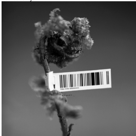
Fig. 1. Biotagging concept: tagged flora

Biotagging used audio-visual equipment to engage a range of individuals in 'tagging' plants and animals with specific and local meaning to them. This was an experiment in subverting conventional approaches to biodiversity monitoring with the aim of expanding ideas of both biodiversity and citizen science. Keywords: Biodiversity, Mass Participation, Citizen Science, Biodiversity Monitoring, Folksonomy.