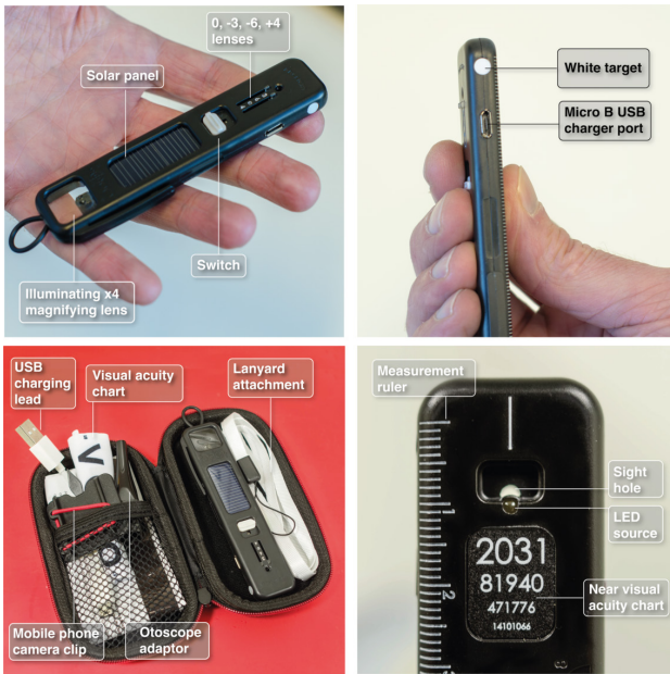
Figure 1 The Arlight with selected features highlighted.

create a slim (110 mm long×26 mm wide×9 mm thick) and light device (18 g).