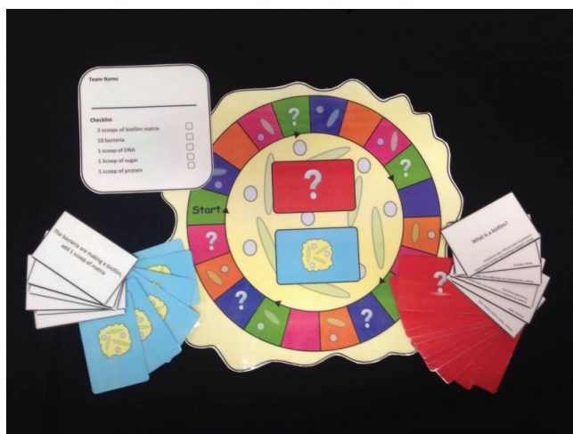
FIGURE 1. The biofilm board game and associated game cards.