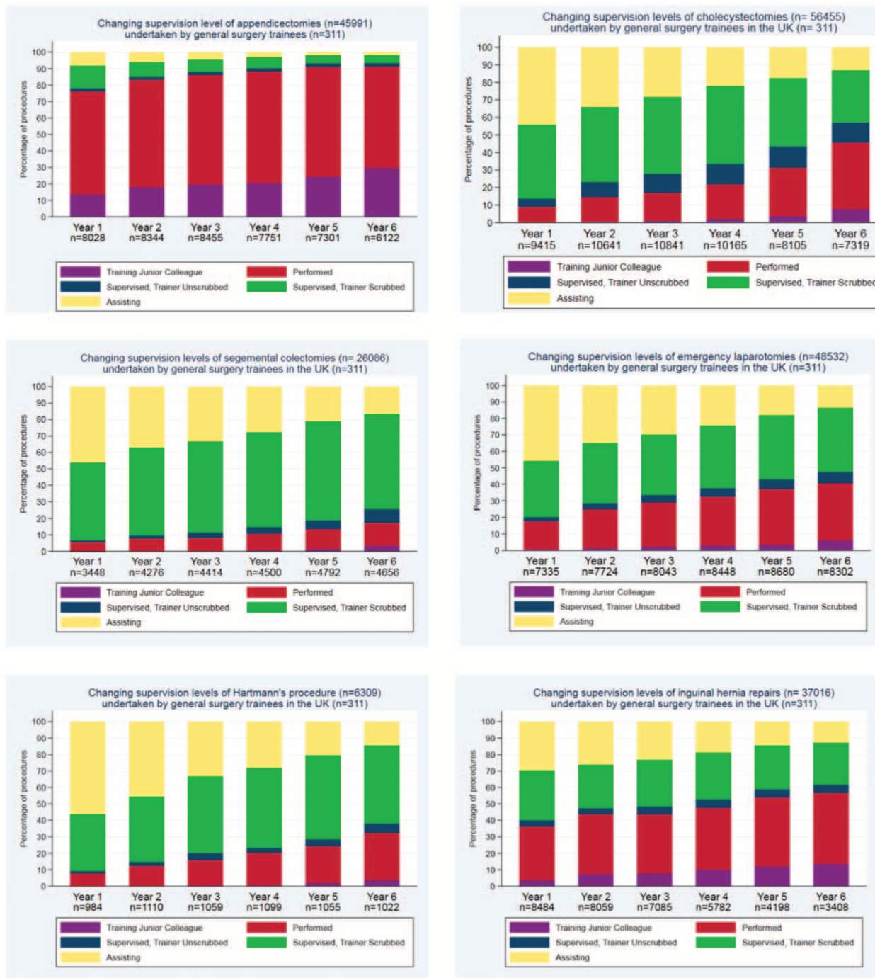
FIGURE 2. Changing supervision levels for index procedures undertaken by UK general surgery trainees.

in the UK. Some trainees, with completion of overseas training before entering UK general surgery specialty training, are already technically proficient in a wide range of procedures. Some UK trainees may have completed additional training or service provision years prior to specialty training and are experienced technically. It is likely that such trainees are allowed to undertake more complex procedures sooner, reflected in the small proportion of year 1 and year 2 trainees undertaking colectomies (5.6% in year 1) or emergency laparotomies