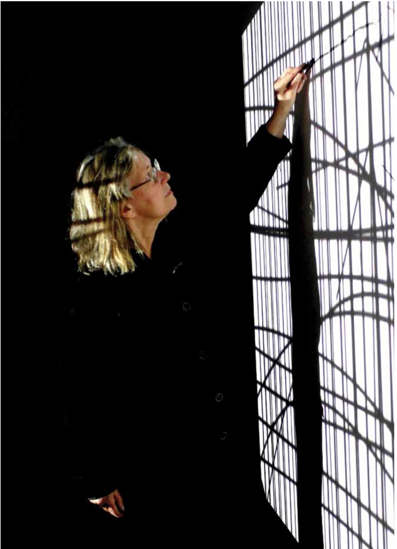
GRID (2017) BY MADELON HOOYKAAS | DETAIL VIEW FROM A PERFORMANCE AT MUSEUM OF CONTEMPORARY ART (MU HKA), ANTWERP