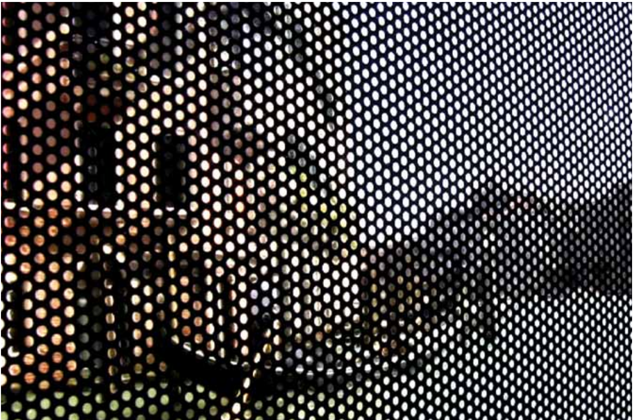
VIRTUAL WALLS I (2017) BY MADELON HOOYKAAS. VIDEO STILL