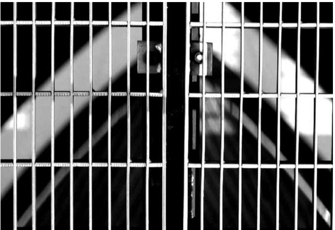
VIRTUAL WALLS | REAL WALLS (2017) BY MADELON HOOYKAAS. VIDEO STILL