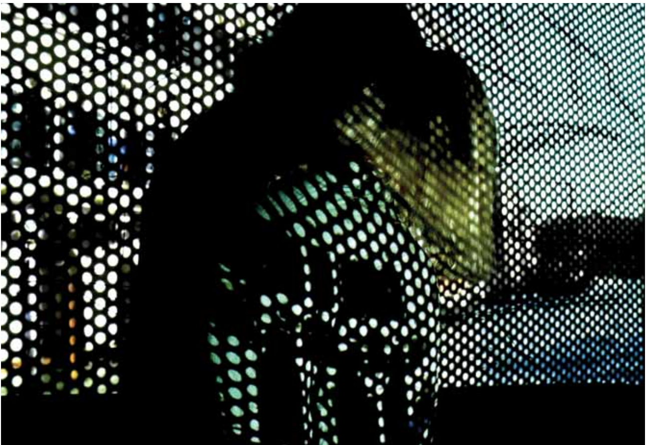
VIRTUAL WALLS I (2017) BY MADELON HOOYKAAS. DETAIL VIEW FROM PERFORMANCE AT EMILY HARVEY ARCHIVE, VENICE