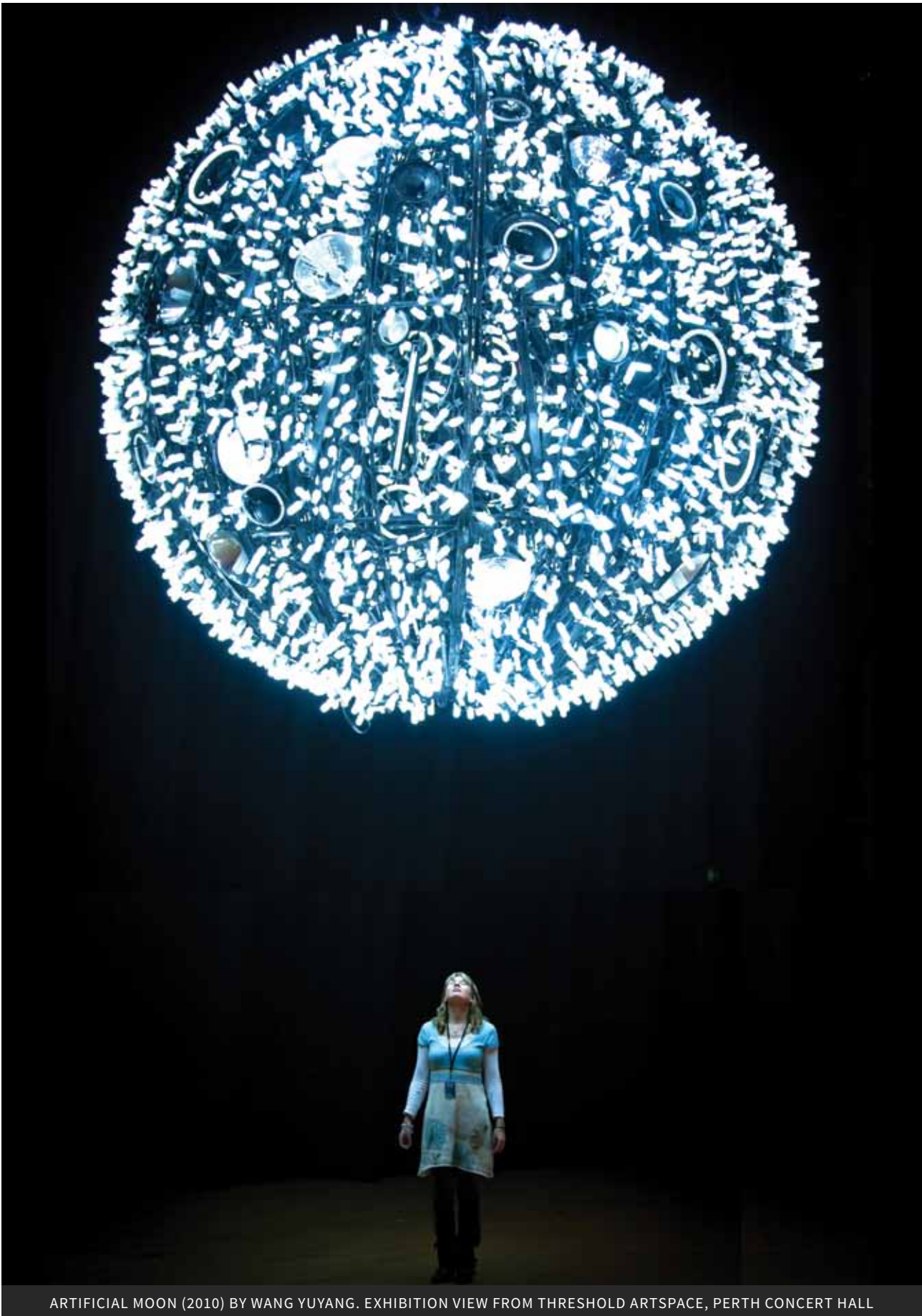
ARTIFICIAL MOON (2010) BY WANG YUYANG. EXHIBITION VIEW FROM THRESHOLD ARTSPACE, PERTH CONCERT HALL