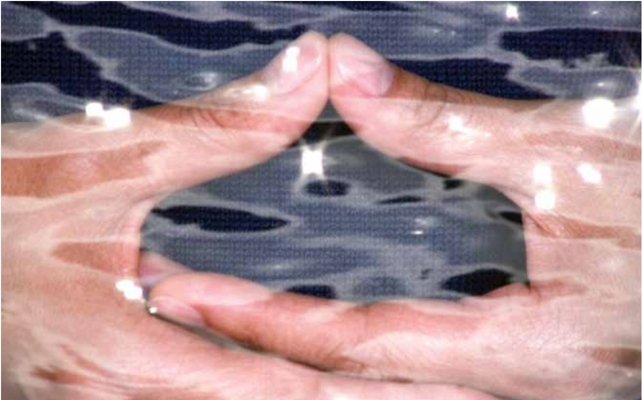
LIGHT (2015) BY MADELON HOOYKAAS. VIDEO STILL