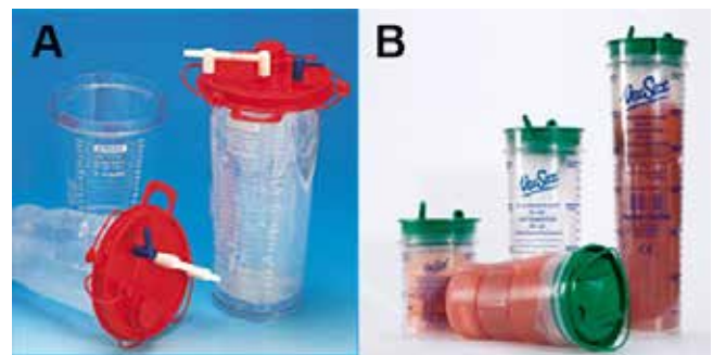
Fig 1. Sep-T-Vac apparatus (panel A) & Vacsax apparatus (panel B)

For the Sep-T-Vac apparatus, the assembly time for the most senior grade is approximately one third of that taken by the most junior grade. Specialist registrars averaged the fastest times for the assembly of the Vacsax apparatus. The average times in all grades were faster for the Vacsax apparatus. The numbers in the study are too small to allow comparison between the specialties.