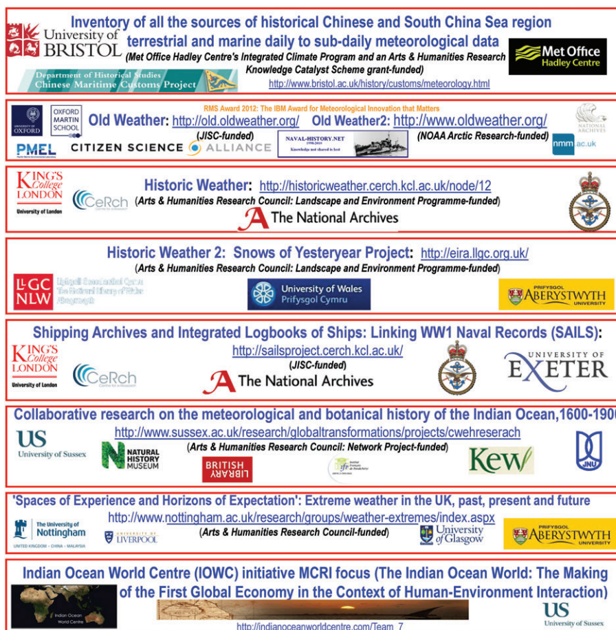
FIGURE 2 | ACRE collaborations with Citizen Science, Social Sciences, Humanities, and Arts projects.

is the 3-year AHRC-funded research project, supported under the AHRC's Care for the future: thinking forward through the past theme and led by the University of Nottingham, with colleagues at Aberystwyth, Glasgow and Liverpool Universities and in partnership with ACRE (Figure 2), The Royal Geographical Society (with the Institute of British Geographers) and Historic England. This team is recovering and integrating historical documentary evidence of past extreme weather events in a series of case studies across the UK—in Southwest, Central and Eastern England, central and coastal Wales and Northwest Scotland. The research, which draws on a wide variety of materials from farmers' diaries and estate correspondence through to school records and qualitative and instrumental weather diaries, is providing the evidence needed to construct a comprehensive history of extreme weather events and their societal implications across the UK over recent centuries ( http://www.nottingham.ac.uk/research/groups/weather-extremes/index.aspx ).