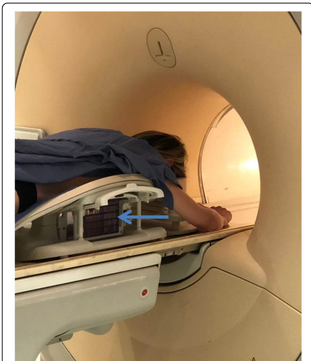
Fig. 4 Magnetic resonance imaging-guided vacuum-assisted biopsy. The patient is prone, positioned on a dedicated coil that allows to insert the needle through a grid (light blue arrow), shown in the figure outside the magnet. After local anaesthesia, the needle is guided to the lesion on the basis of specifically acquired magnetic resonance images. To conclude the procedure, the patient has to enter and exit the magnet at least three times (see text)

MRI-guided biopsy is performed on the MRI table, with a sequence of movements inside and outside the magnet. The patient is placed in prone position with the targeted breast gently compressed in a dedicated biopsy grid (Fig. 4). A dedicated radiofrequency coil is required to enable image acquisition and to guide needle placement. The procedure is safe and accurate in specialised centres and relatively fast, but longer if compared to other imaging-guided procedures. Notably, there may be