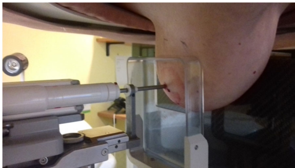
Fig. 2 Mammography-guided (stereotactic) vacuum-assisted biopsy. The patient is in prone position lying on the table over the field of view of the image, with the breast pendent by gravity (she does not see the procedure). After local anaesthesia, the needle is guided to the lesion by the computer on the basis of specifically acquired mammographic images

In the last few years, mammography guidance can also be performed using digital tomosynthesis, a technique