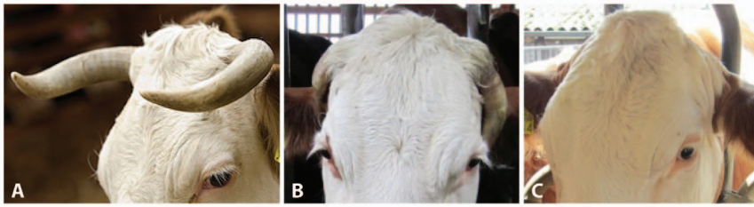
Figure 1. Horn phenotypes in Simmental cattle. Normally horned cow (A), cow with loosely attached small horns termed scurs (B), smooth polled cow showing the typical peaked shape of the proximal frontal bone (C). doi:10.1371/journal.pone.0093435.g001

a noncoding RNA [18], [19]. A polymorphism at RXFP2 explains horn variability in sheep [20], [21].