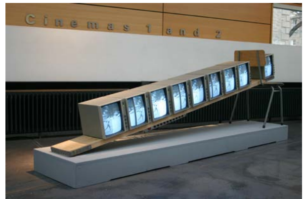
Figure 1: Tony Sinden, Behold Vertical Devices , DCA, Dundee, 2006.

In the early stages of the REWIND project an Advisory group compiled a selected list of artists - attaining to the criteria of equality and diversity - that would be involved in the project. This list was revised and implemented at later stages, where more artists were included. The information, the materials and the interviews collected were made publicly available through the online database/website.