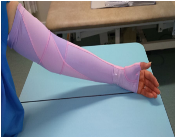
Figure 1. Example of dynamic Lycra® orthosis used in study.

complex, with many interacting elements. 5 Exploring and understanding this complexity and its implications for the feasibility of routine adoption of treatments in national and international practice contexts is therefore vital when developing and testing new rehabilitation interventions within clinical trials.