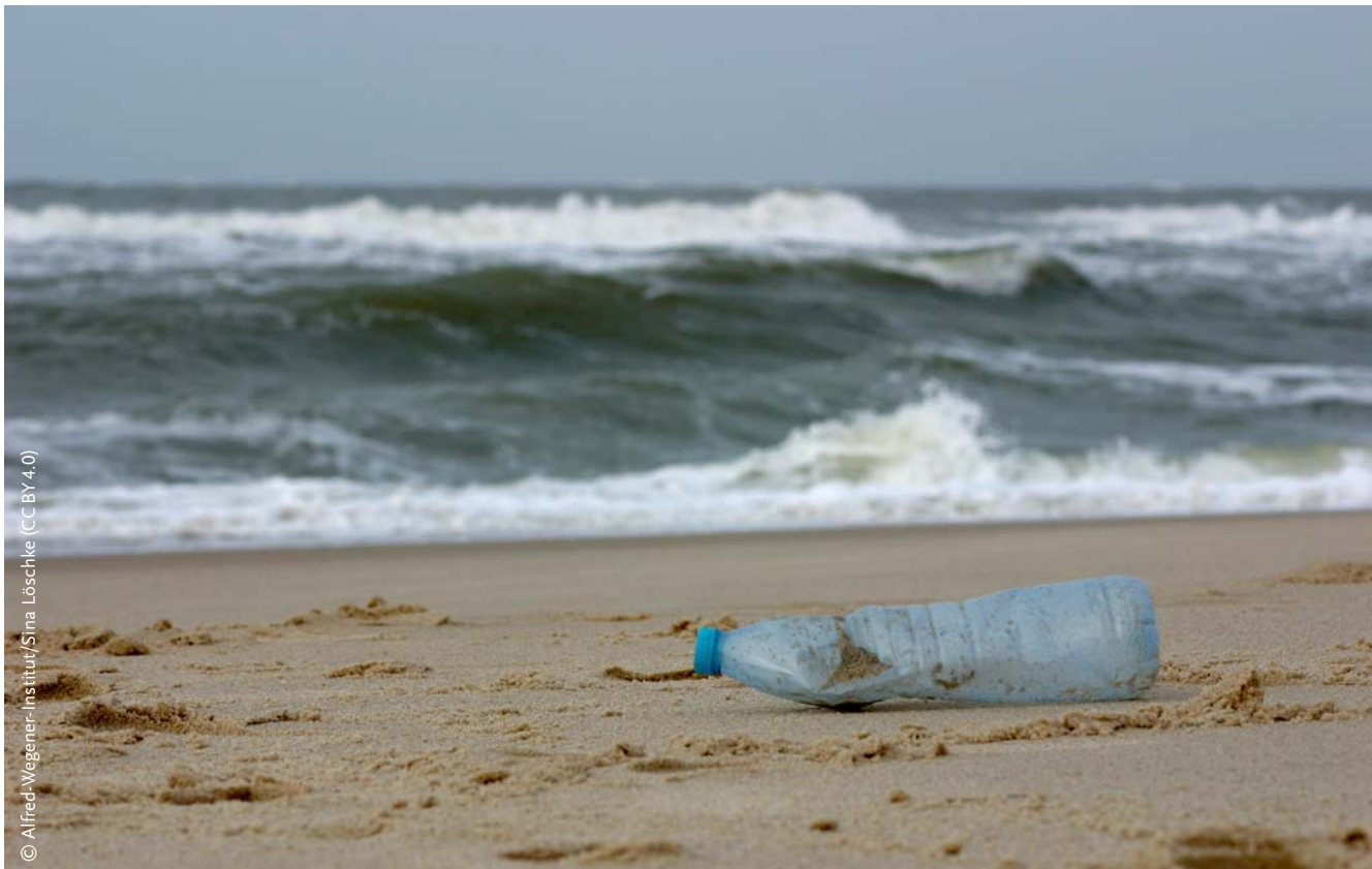
FIGURE 1: Litter has become a serious threat to the (marine) environment. Summarizing results from more than 2,000 scientific studies worldwide, the Alfred Wegener Institute Helmholtz Centre for Polar and Marine Research (AWI) compiled a comprehensive online data base ( LITTERBASE ). Global maps and figures show the global amount, distribution and composition of marine litter and its impacts on aquatic life, and address the general public as well as policy makers, authorities, scientists, and media.