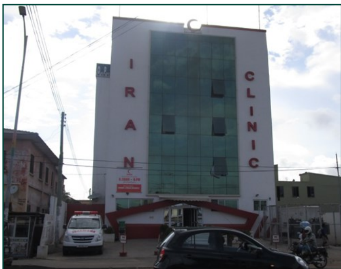
Iran Clinic, Accra.