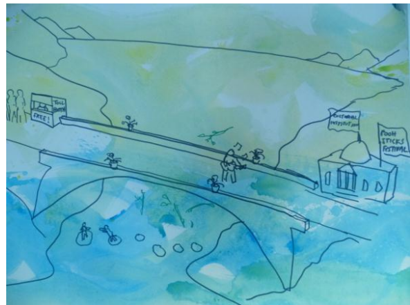
One group's bridge emphasized the need to provide arts opportunities for local people of all ages