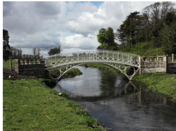
Linlathen Bridge crosses Dundee's River Dighty

These all serve as strong examples of efforts to bridge culture-led regeneration with place-based regeneration. Large scale, iconic cultural projects present an ideal base for raising the shared aspirations, energy and demand that is required for large scale physical regeneration.