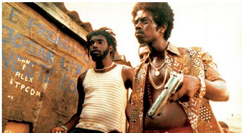
Figure 3 – Zé Pequeno and the evil of favela's criminal

Screenshot of City of God where Zé Pequeno appears in his powerful semblance