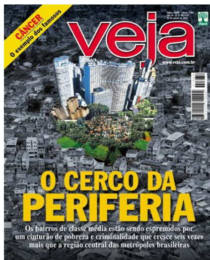
Figure 2 – Veja Magazine's cover

Weekly magazine Veja (24/01/2001). The cover says: “The periphery encircle. Middle class neighbourhoods have been squeezed by a belt of poverty and criminality that grows six times more than the inner cities in Brazilian metropolis”