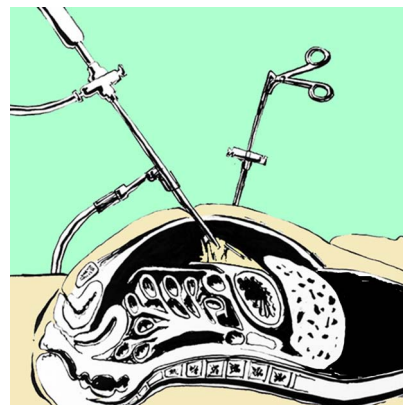
Figure 2. Thiel cadavers form a suitable model for laparoscopic procedures. In laparoscopy the abdomen is filled with gas; instruments, a light source, and a camera are then inserted through small incisions while the surgeon follows the procedure on a screen. It takes significant training to develop the skills and dexterity needed for this, and Thiel cadavers are regularly used to train surgeons. Drawing by Emmanouil Kapazoglou. doi:10.1371/journal.pbio.1001971.g002

may be realistic in some aspects but not in others, care must be taken in determining the extent to which any training experience translates to the clinical equivalent. Product developers need to under-