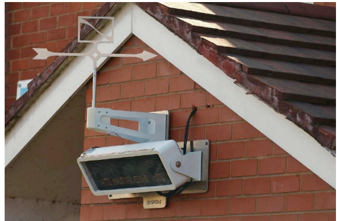
Figure 4. Wayfinder.

Two pieces of journalism reported on Wayfinder, one in video and the second as a photo study. These contained reactions from community organisers and members of the public, finding more conflicting opinions than for Viewpoint. The general concept was well-received: in one interview, a local organiser expressed that while awareness of their activities was high within their own circles, Wayfinder could help to reach a wider audience around the community. However, the particularly implementation was met with criticism. Many interviewees felt that the fidelity of the information—limited to under 160 characters—was too low and many did not realise that the arrow was