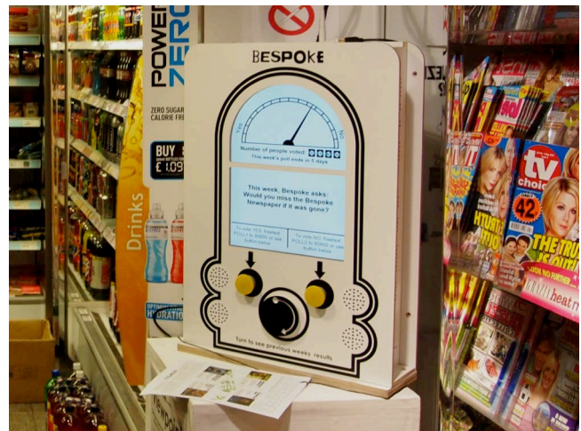
Figure 3. Viewpoint.

The last stage in the process was to commission a final round of reports from the journalists, this time focusing on the impact that the devices had and the reaction from the community. This began at the point of deployment, where a journalist was present documenting the installation and collecting sound bites from the team and community members. At the end of the deployment, one of the journalists conducted interviews with two of the community leaders who posted questions, collecting highly positive feedback, particularly about the quantity of votes received. Another conducted a photojournalism study, collecting quotes from passersby who used the device. These were generally more sceptical, with a significant number of interviewees suggesting that they had not used the device,