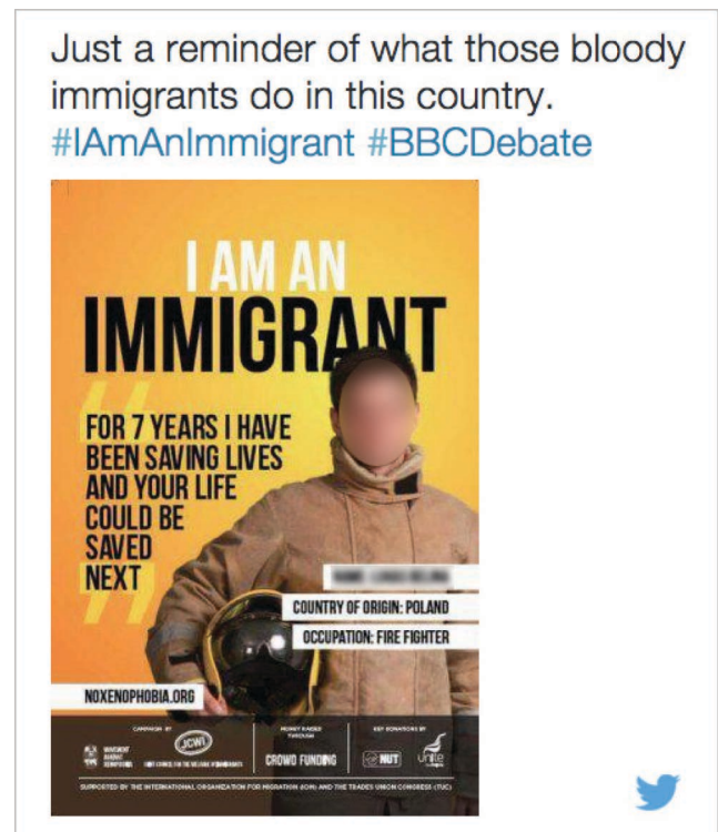
Figure 2. An example of one of the participants using Twitter as a platform for political activism.

All eleven participants who watched the debate with a friend or family member discussed the online content they came across with the person because face-to-face discourse had greater value to them (P5: “Having a conversation with a real person is inherently better”). The conversations that were created broadened the experience of the participants: